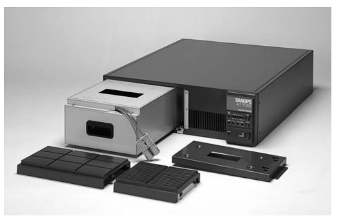
Fig. 1: Battery Replacement

Furthermore, a maintenance bypass circuit has been included in the