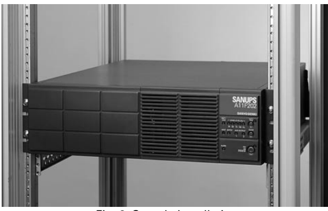
Fig. 2: Sample Installation

The "SANUPS A11F" Series is compatible with both vertical installation and 19-inch rack mounting (3U for 2kVA; 4U for 3kVA).